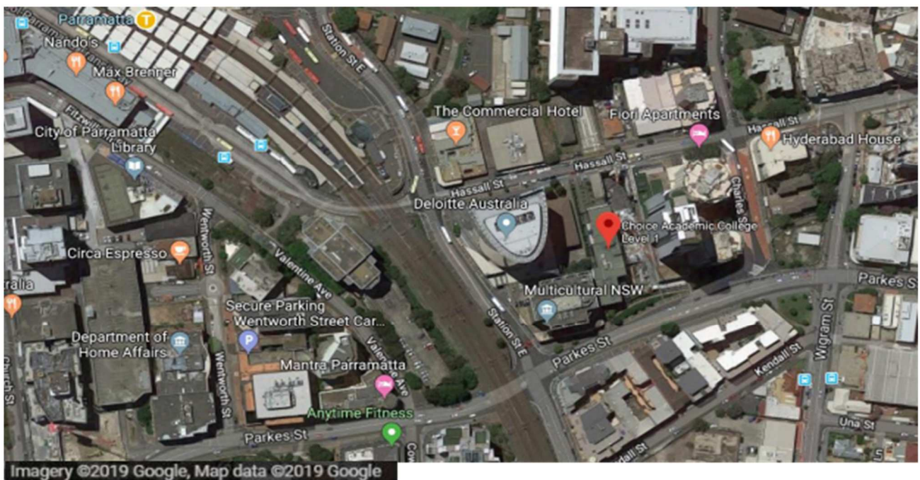
Campus Exterior- Level 1, Hassall Street, Parramatta, NSW 2150