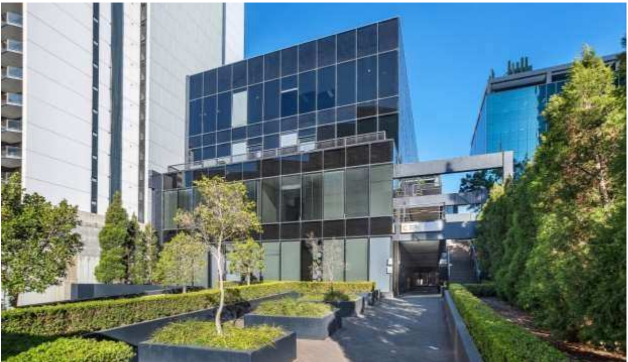
Campus exterior – Level 1, 7 Hassall Street, Parramatta NSW 2150