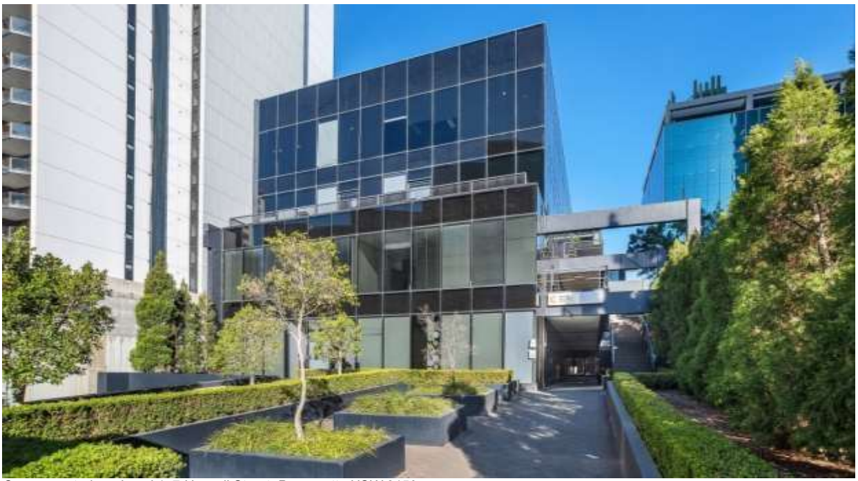
Campus exterior – Level 1, 7 Hassall Street, Parramatta NSW 2150